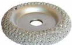
DWSP Ø 76 x 16 mm, Ø 3" x 5/8"