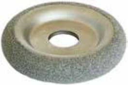
DW 150 x 32 mm, AH 38.1 mm, Ø 6" x 1 1/4"