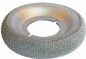
DWSP Ø 150 x 32 mm, Ø 6" x 1 1/4"