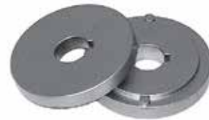
Hubflange Kit Art. No. 132315