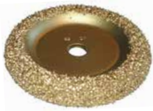
DWP Ø 102 x 19 mm, Ø 4" x 3/4"