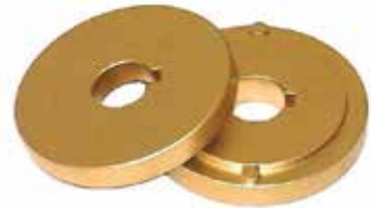
Hubflange Kit Art. No. 132315