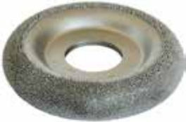
DW 150 x 32 mm, AH 50 mm, Ø 6" x 1 1/4"