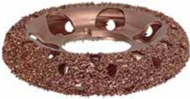
DW Ø 150 x 32 mm, Ø 6" x 1 1/4"