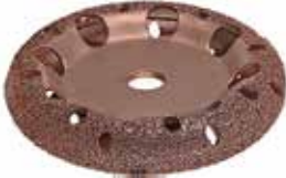
DWM Ø 130 x 30 mm, Ø 5 1/8" x 1 3/16"