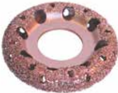
DW Ø 125 x 25 mm, Ø 4 7/8" x 1"