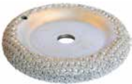
DWSP Ø 102 x 19 mm, Ø 4" x 3/4"