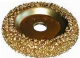
DWP Ø 76 x 16 mm, Ø 3" x 5/8"