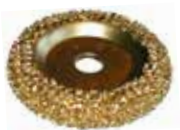
DWP Ø 50 x 13 mm, Ø 2" x 1/2"