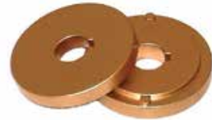
Hubflange Kit Art. No. 132315