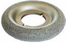
DW 150 x 32 mm, AH 60 mm, Ø 6" x 1 1/4"