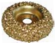
DWP Ø 50 x 19 mm, Ø 2" x 3/4"