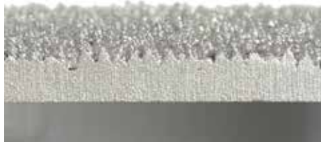
Steel Shot Grit Design