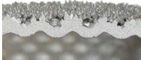
Super Patriot Design