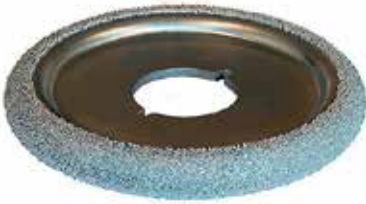
DW 200 x 25 mm, AH 60 mm, Ø 8" x 1"