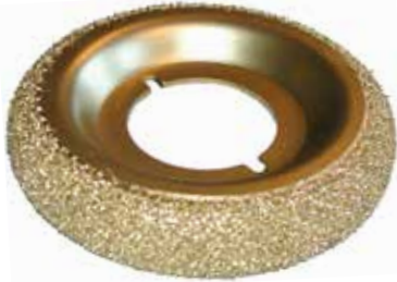
DWP Ø 150 x 32 mm, Ø 6" x 1 1/4"