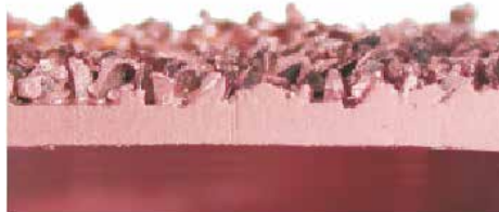
Copper Carbide Design