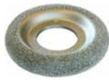
DW 125 x 25 mm, AH 50 mm, Ø 5" x 1"