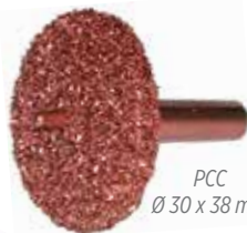
PCC Ø 30 x 38 mm