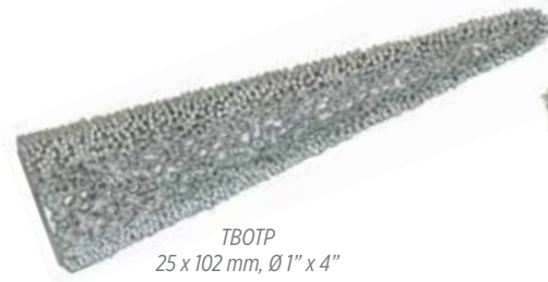
TBOTP 25 x 102 mm, Ø 1" x 4"