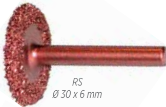
RS Ø 30 x 6 mm