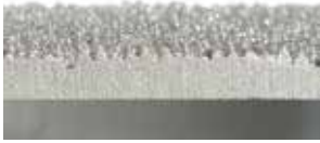
Steel Shot Grit Design