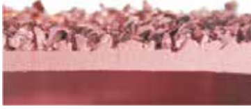
Copper Carbide Design