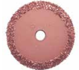
RS, Ø 60 x 3.5 mm, Ø 2 3/8" x 1/8"