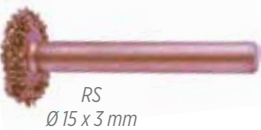
RS Ø 15 x 3 mm