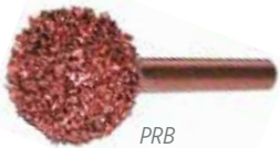
PRB Ø 20 x 55 mm