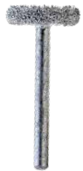
RS 15 x 3 mm, Shaft 3 mm Ø 5/8" x 1/8"