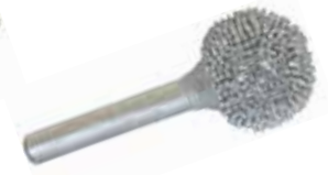
PRB 20 x 55 mm, 6 mm Shaft, Ø 13/16" x 2"