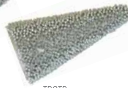
TBOTP 25 x 50 mm, Ø 1" x 2"