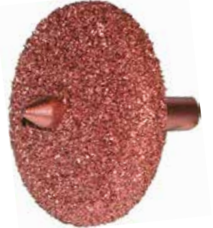
PCC Ø 50 x 50 mm